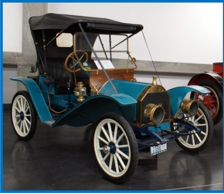
1909 Hupmobile Runabout

H upp Motor Car Company of Detroit, Michigan, built the Hupmobile, a line of automobiles from 1909 through to 1939.