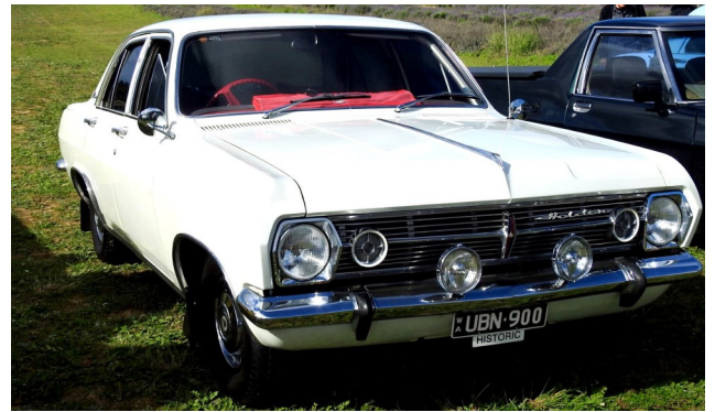
Rob Hyde - HR Holden