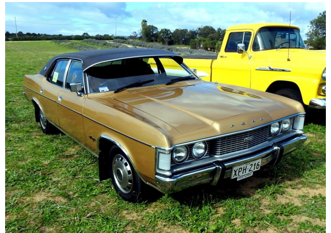
Brian Rodwell - 77 Ford Fairlane